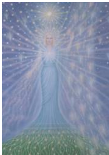
The Divine Mother

Later, a Divine Mother, working from yet a higher level showed up.