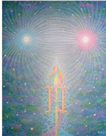
Pollux and Castor

In the three horned Signs, well symbolized by the animals, the Ram, the Bull and the Alpine Ibex (Capricorn), the two horns indicate duality, but when illumination of the mind is achieved, Their united symbol is the Unicorn. The horns are now twined into one horn, piercing glamour and illusion.